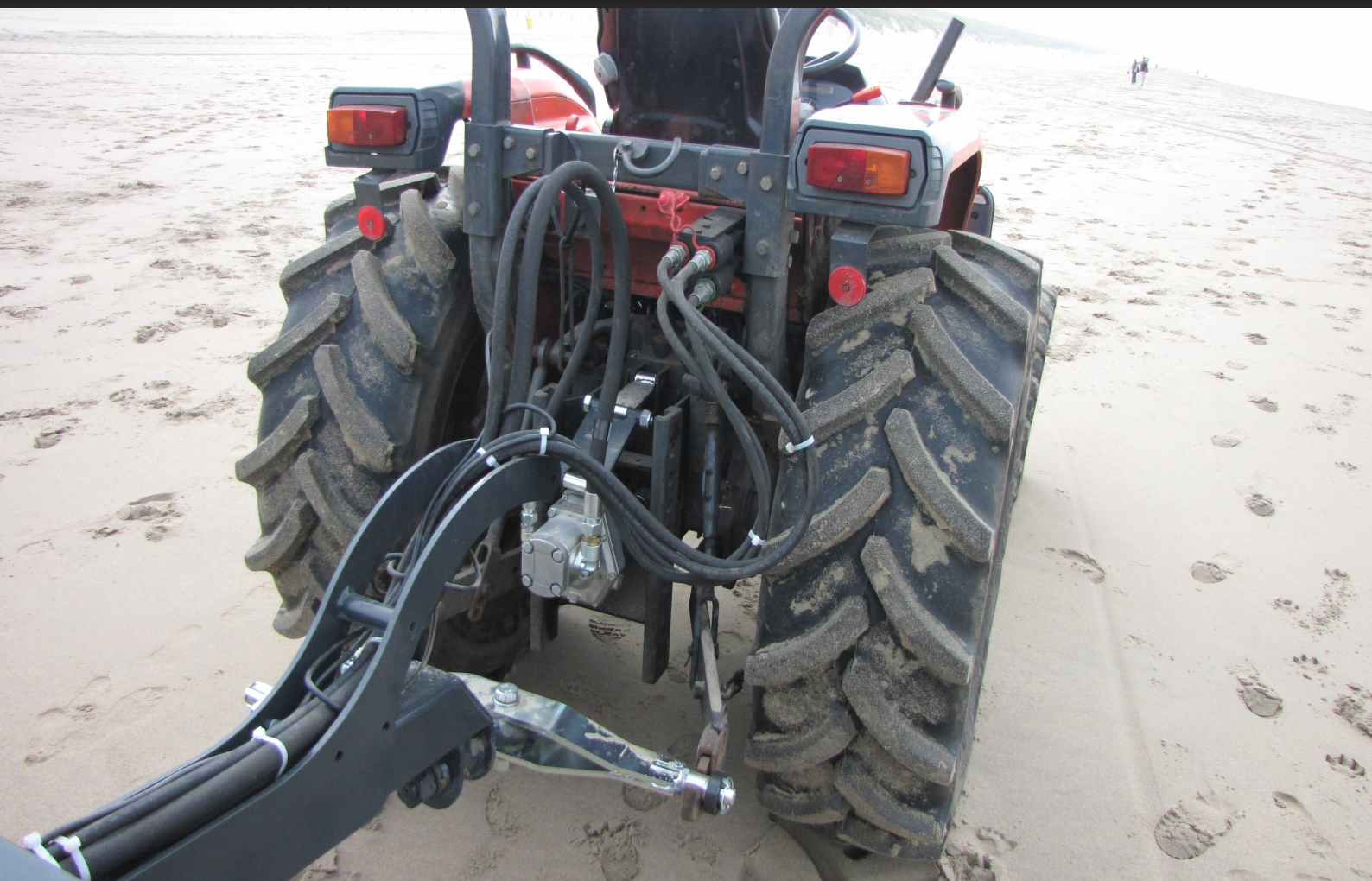
Connected to third-point lifting system tractor - Hydraulic pump direct to PTO tractor with safety ring