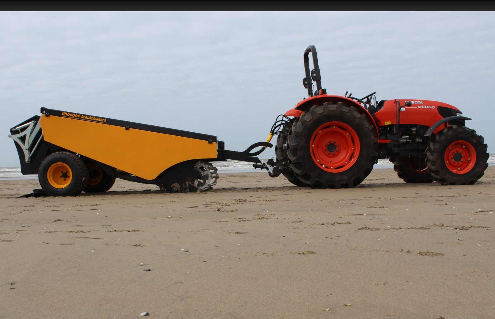
Cleaning system Unique maintenance-free pick roller particularly suitable for cleaning plastics