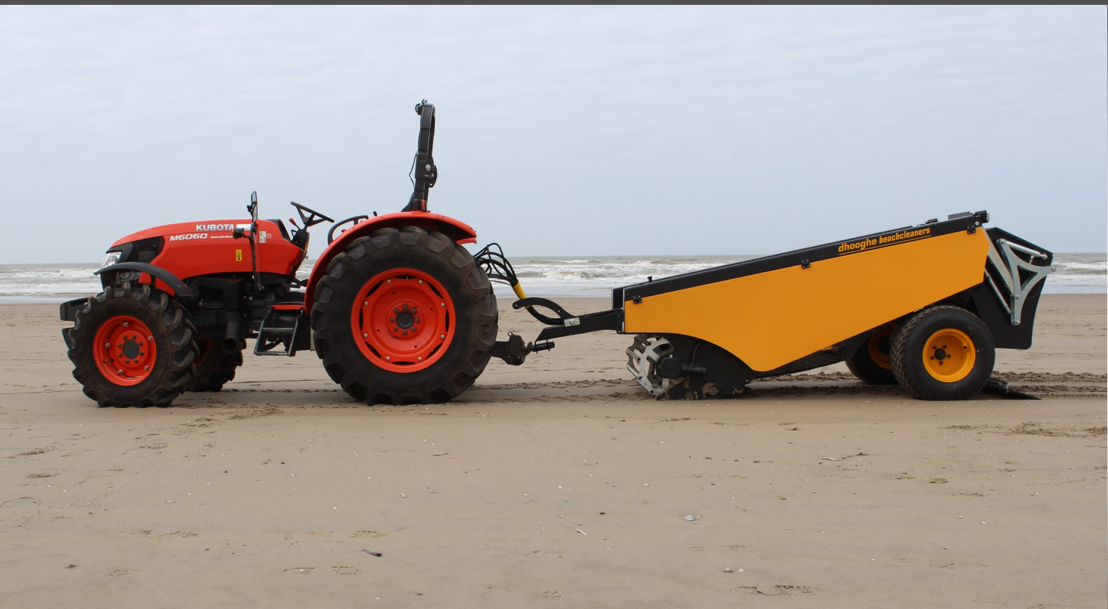
dhooqhe beachcleaners Junior XL